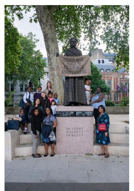
Venture Fresh Expressions Mummies Republic Universal Credit campaign 2019

It took great courage for our members to stand in front of a collective of politicians, heads of housing associations, national campaign senior leaders and headteachers in the Houses of Parliament, impart their experience of the racial and gender biased nature of the policy and its egregious attack on households, simply for they being poor. Courage for the members came in knowing that nothing but policy change would improve the system.