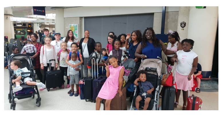
Venture Fresh Expressions Mummies Republic Butlin's 2019 retreat

A further achievement was the annual retreats initiated to mitigate the scourge of poverty around the summer holidays. In the words of one of our members "This summer my child can report back to school, that they did more than go to the playground". This annual activity began in 2016 as a learning outcome from the group therapy classes and ceased due to Covid-19.